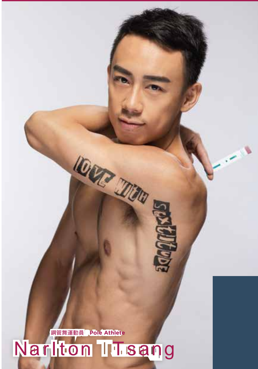
鋼管舞運動員 Pole Athlete