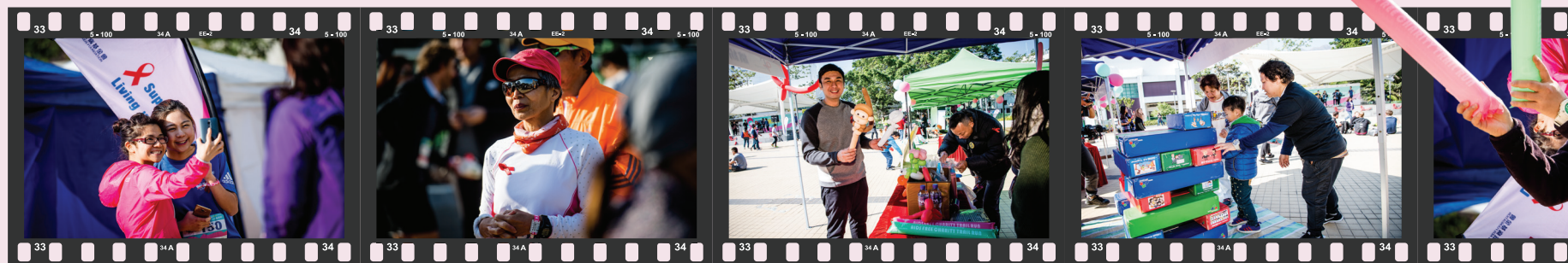
跑手留下紀念一刻 Racers captured the moment of happiness

活動獲得超過200名選手參與，大會更設有多項教育攤位遊戲供公眾參加，讓市民正確了解愛滋病。