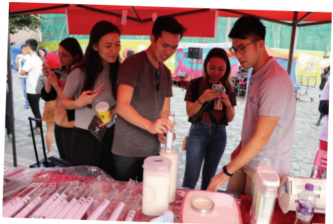
活動設有安全套工作坊，教育市民製作安全套的過程 Condom workshop was set up to educate public the procedure for making a condom

為響應12月1日的「世界愛滋病日」，香港愛滋病基金會每年都會透過不同媒介和渠道，宣揚關懷和支持感染/病患者的訊息。今年特別加入 AIDS FREE 越野慈善跑起動禮，除了為一眾跑手打氣，更希望為受愛滋病影響人士籌得更多善款。