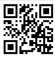
活動精華短片 Highlight Video