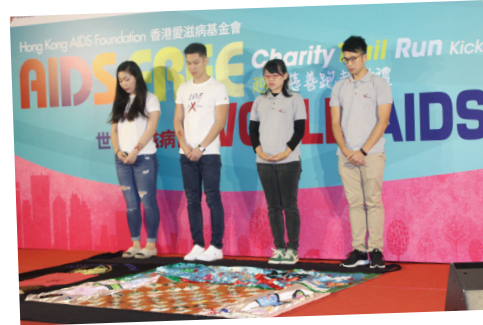
由義工代表進行開掛被儀式，悼念因愛滋病而逝世的朋友 The quilt opening held by volunteers representatives in remembrance those died of AIDS

More than 200 racers joined us and game booths were set up to educate public the correct knowledge on HIV/ AIDS.