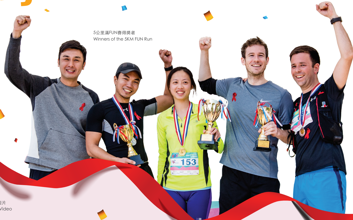
5公里滿FUN賽得獎者 Winners of the 5KM FUN Run