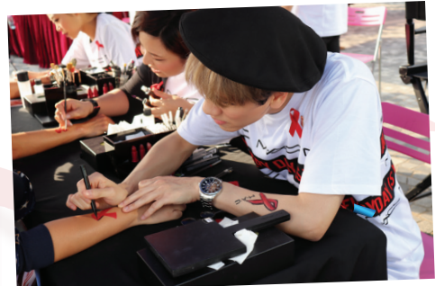
著名化妝品牌M.A.C 的化妝師為公眾畫上紅絲帶的圖案 Body painting workshop for the public by M.A.C make-up artists to commemorate WAD

To commemorate the World AIDS Day on 1 st December, the Foundation utilizes different platforms and channels to spread the message of supporting for those people living with HIV/ AIDS each year. This year, we combined the event with AIDS FREE Charity Trail Run Kick-off ceremony, not only cheer up the runners but also to raise fund for those affected by HIV/AIDS.