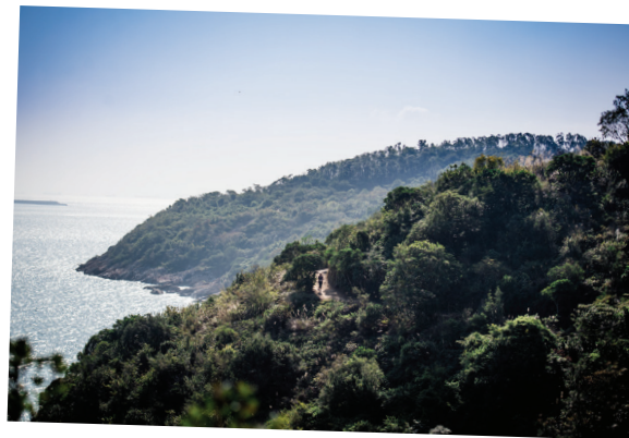
跑手挑戰自我的同時亦可欣賞梅窩自然風貌 Racers can challenge themselves, at the same time enjoy the natural beauty in Mui Wo