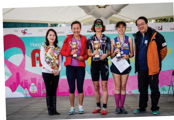
10公里速度賽-女子組得獎者 Winners of the 10KM Challenge Run - Female Group