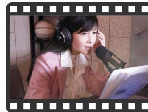
周慧敏為是次電視電台公益廣告錄音 Ms. Vivian Chow is the narrator of our API