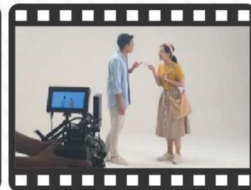
電視公益廣告的拍攝花絮 Behind the scenes of our API