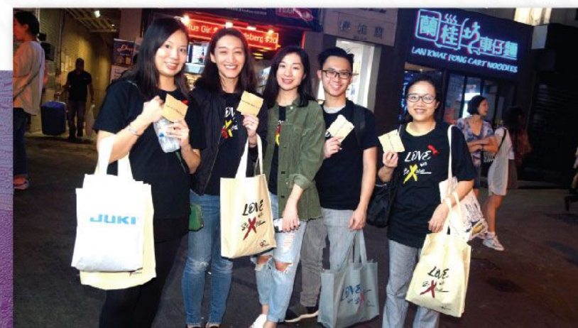
基金會同事與一眾義工當晚於中環蘭桂坊及蘇豪區向途人派發安全套宣傳包 Our staff members and volunteers distributed condom packs with education materials to passers-by in Lan Kwai Fong and Soho districts

The Foundation also organised a Testing Week from 26 November to 2 December to provide free, anonymous and confidential HIV anti-body tests and counselling services for the public. We provided VCT services to 47 members of general public during the testing week.